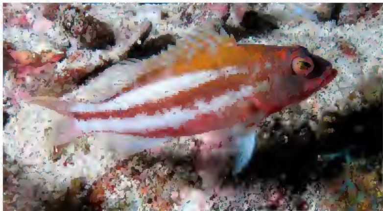
FIGURE 7. Rare color pattern of Serranus pulcher from Príncipe Island.